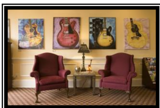
This year’s event is at Millennium Maxwell House Hotel.